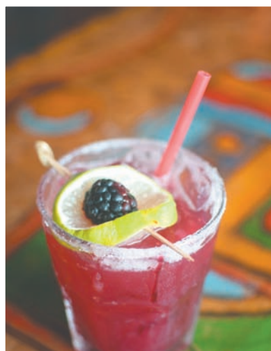
Cantina Azteca offers diners a full bar where they can enjoy hand-crafted margaritas.

District manager, Rey Azteca restaurants